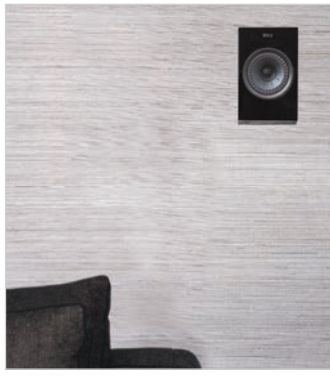
R8a on wall