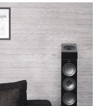
R8a on speaker top