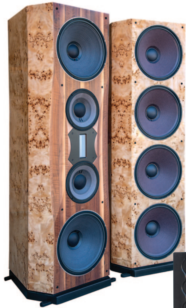
For those hungry for bottomless, rapturous bass, a complement of two Bass Towers , matched to the speaker model and finish selected, are irresistible. (Shown above on right with MR!777AT)