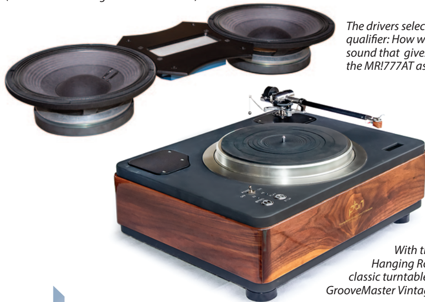
The drivers selected for PBN speakers are ultimately measured by one qualifier: How well do they harmonize to create the balanced, immersive sound that gives clean, pure, effortless “truth” to the music? Shown is part of the MR!777AT assembly: MF 2 x 12” mid-range and HF 1 x 6” Ribbon Driver.