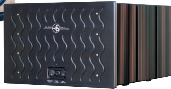
PBN’s commanding EBS-A3 amplifier is itself part of a series of masterfully engineered components. The copper coil alone weighs 70 pounds. This amp, when teamed with one of PBN’s Olympia pre-amps and DAC converters, lays a foundation that elevates the full system performance.

Each speaker he builds performs as part of an integrated system that includes pre-amps, amplifiers, speakers, and turntables. Each link in this chain is as strong and painstakingly tested as the others. The standard of performance is uncompromising—and the intuitive, finely attuned listening skills Noerbaek brings to his work give his systems an almost palpable sense of presence—of “ thereness .”